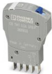
Thermomagnetic device circuit breaker, 1-pos., tripping characteristic SFB, 1 PDT contact, plug for base element.

Please be informed that the data shown in this PDF Document is generated from our Online Catalog. Please find the complete data in the user's documentation. Our General Terms of Use for Downloads are valid ( http://download.phoenixcontact.com )